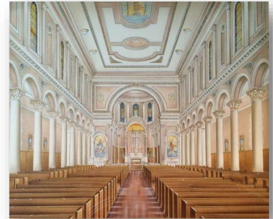
Artist's rendering of new interior of church

"Ours is a preparation for the generation that will succeed us, and eminent good will be done this way by us. You may not live to see it, but you will have sown the seed . . ."